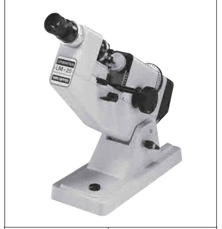
Model:LM-25 Internal Reading System Target:Crossline and Corona